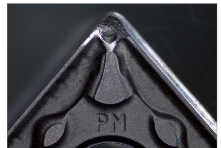
Indexable insert, shows tool wear. Reflected light, ringlight, zoom 0.8x