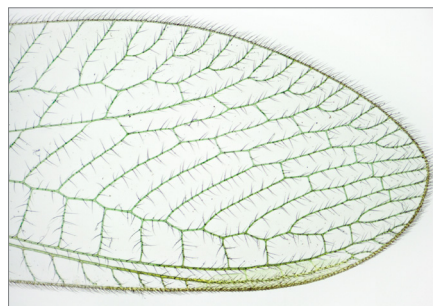
Green lacewing Transmitted light brightfield